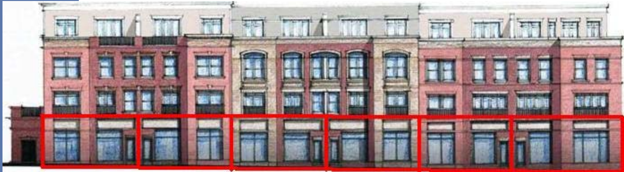
BUILDING V – 19366 to 19386 Diamond Lake Drive